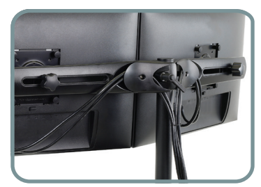
CABLES ARE GUIDED CLEANLY THROUGH CABLE