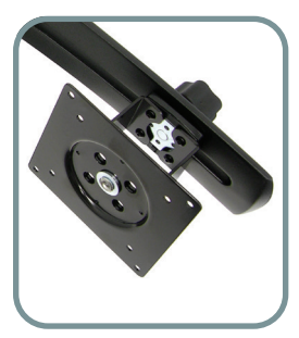
MONITORS CAN BE ALIGNED INTO A SEAMLESS CURVED PROFILE TO BENEFIT VIEWING.