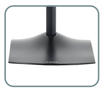
SLEEK, LOW-PROFILE BASE WITH DURABLE FINISH PROVIDES STABILITY AND SAVES SPACE.