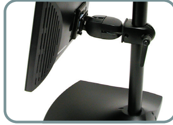
MONITOR HEIGHT CAN BE ADJUSTED ON POLE (33-091-200 SHOWN). 28" POLE (20-137-200) ALSO AVAILABLE, ORDER SEPARATELY.