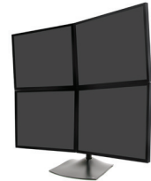
DS100 Quad-Monitor Desk Stand