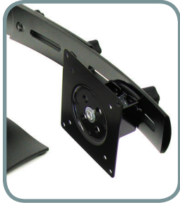
MONITORS CAN BE ALIGNED INTO A SEAMLESS CURVED PROFILE TO BENEFIT VIEWING.