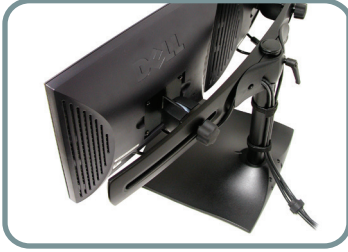
CABLES ARE GUIDED CLEANLY THROUGH CABLE CHANNELS