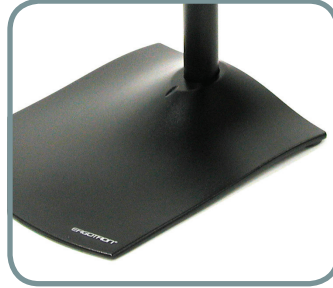
SLEEK, LOW-PROFILE BASE WITH DURABLE FINISH PROVIDES STABILITY AND SAVES SPACE.