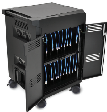
PS Laptop Management Cart with pre-installed Cat 6 Ethernet cables