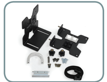
INCLUDED MOUNTING PADS AND STRAP INCREASE STABILITY

Download additional resources at ergotron.com .