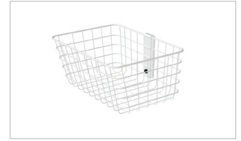
Small Wire Basket