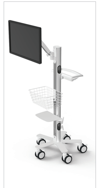
Patient Computer & Gaming Cart