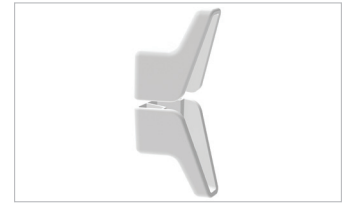
Small Cord Wrap