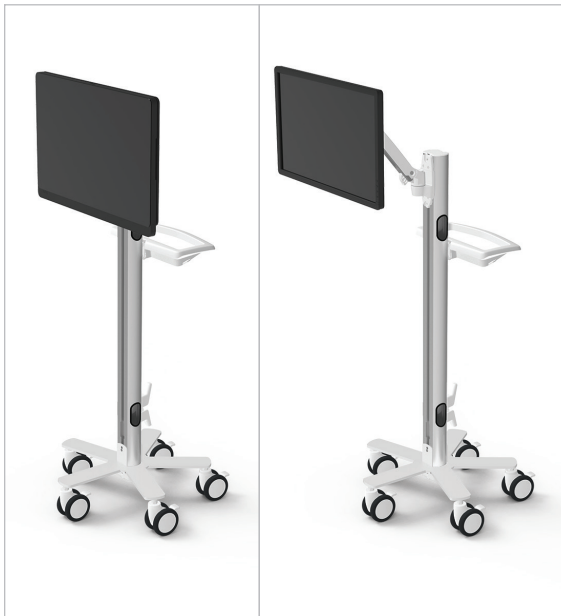
Remote Care & Signage Cart

These agile workstations support efficient workflows in healthcare, manufacturing and other environments. Easily move and store equipment in an easy-to-clean, open architecture design that's fully customizable for each application. Select a pre-designed solution or configure a unique cart specific to your needs with the help of our project team.