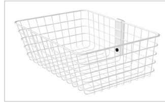
Large Wire Basket