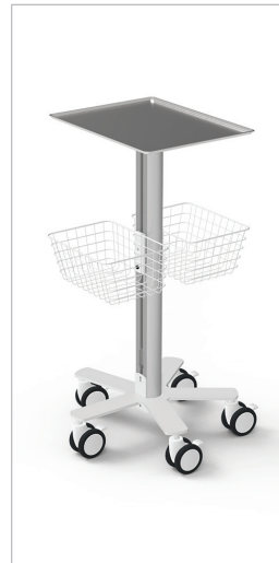
Medical Instrument Cart