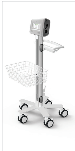
Medical Device Cart