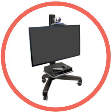
Mobile Media Center Engage in-person and remote team members