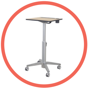
Mobile Desk Moves easily from room to room for individual or group work