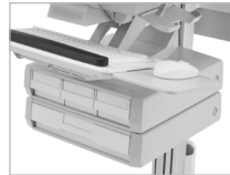
4 DRAWERS (1 PRIMARY TRIPLE AND 1 SUPPLEMENTAL SINGLE)