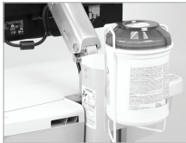
T-SLOT WIPES HOLDER 98-450

Durable, easy-to-clean exterior composed of aluminum, high-grade plastic and zinc-plated steel