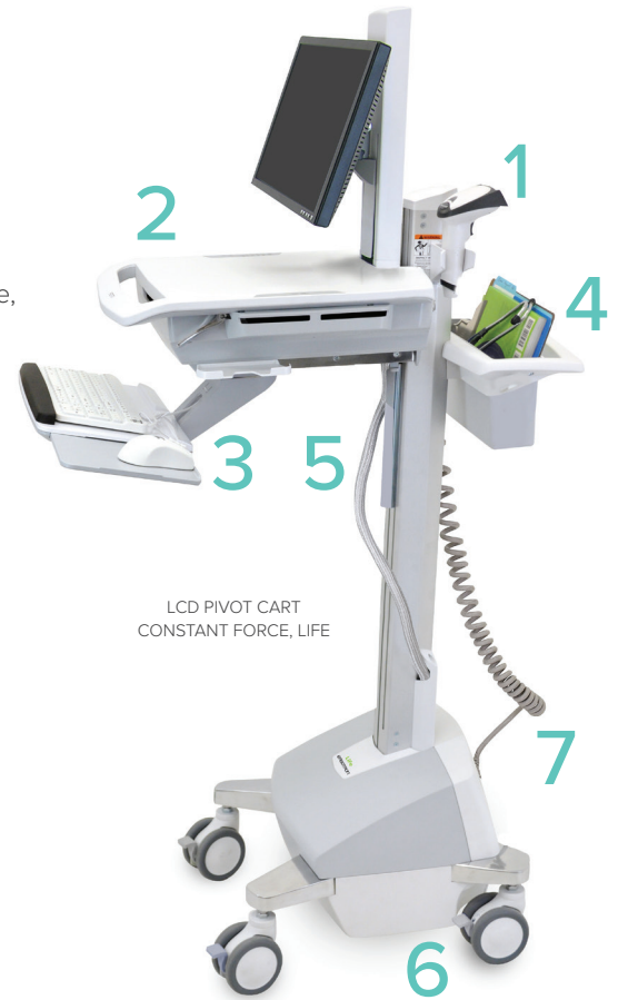
LCD PIVOT CART CONSTANT FORCE, LiFe

Durable, easy-to-clean exterior composed of aluminum, high-grade plastic and zinc-plated steel