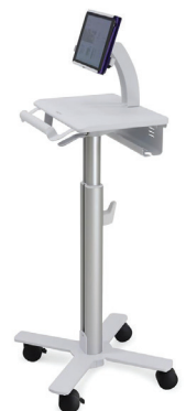
StyleView Tablet Cart SV10-1400-0