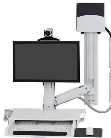
StyleView Sit-Stand Combo System with Worksurface 45-594-216