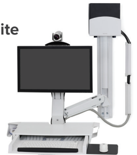
StyleView Sit-Stand Combo System with Worksurface 45-594-216