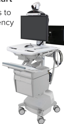
StyleView® Telemedicine Cart Dual Monitor, Powered SV44-57T1-1