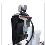
StyleView Camera Shelf 97-776-194