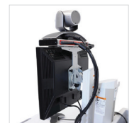
StyleView Camera Shelf 97-776-194