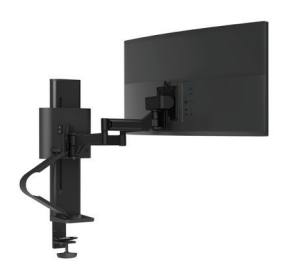
Single with Panel Clamp