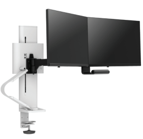
Dual with Panel Clamp